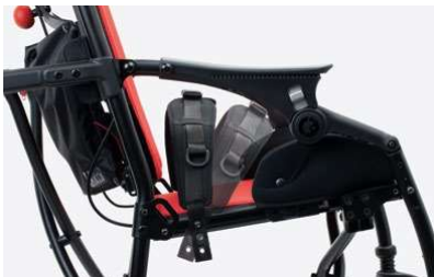
947 Pelvic belt with variable angle Available in two sizes.