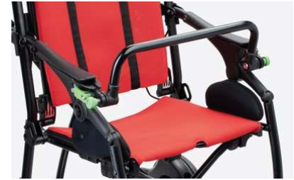
839 Front handlebar Adjustable in tilt. Easy to remove to fold the stroller.