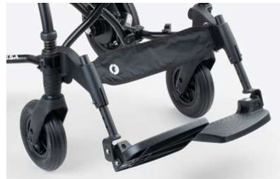
956 Footrests adjustable in tilt