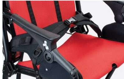
920 Four point pelvic belt Available in two sizes.