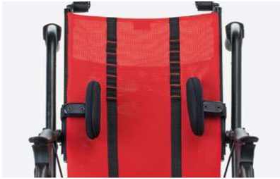
838 Trunk side supports adjustable in height, width and rotation. Available in two sizes.