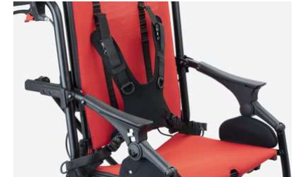
853 Vest harness