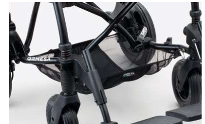
858 Shopping basket