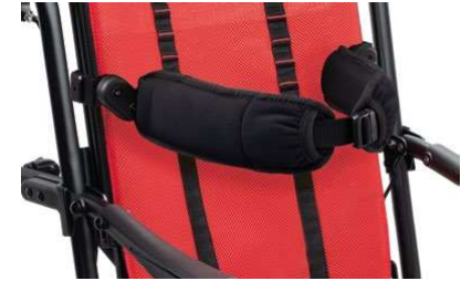
868 Wrappable and flexible trunk supports Adjustable in height, width and transversally.