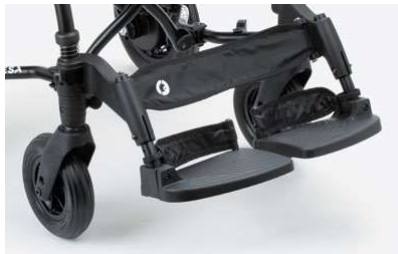
960 Heel rests