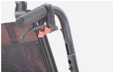
951 Height adjustable push handles

It increases the total height of max. 7 cm/2,7 in (94-101 cm/37-39,7 in)