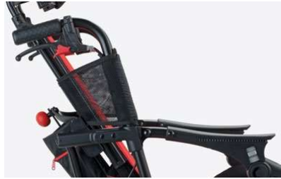
844 Padded side protection covers