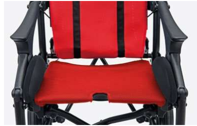
958 Padded pelvic side supports