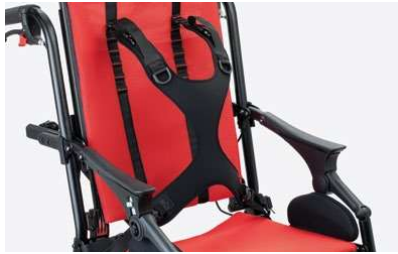
853 slim Four point shaped harness