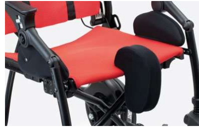
834N Padded abduction block removable. Available in two sizes.