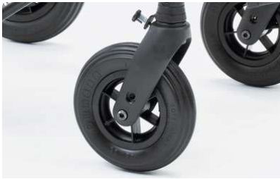
812 Front wheel directional locks