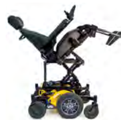
WITH LIFT AND TILT

"WE'VE BEEN CREATING CUSTOM MADE VEHICLES FOR 25 YEARS, SO THAT YOU CAN LIVE THE LIFE YOU CHOOSE"