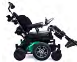
WITH POWER LEGS AND RECLINE