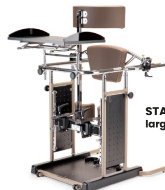
STANDY 4 large