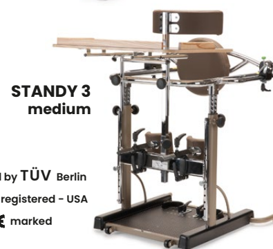
STANDY 3 medium

Tested by TÜV Berlin FDA registered - USA CE marked