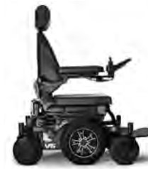
V6 HYBRID - BLACK WHEELS

"WE'VE BEEN CREATING CUSTOM MADE VEHICLES FOR 25 YEARS, SO THAT YOU CAN LIVE THE LIFE YOU CHOOSE"