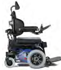
V6 FRONT WHEEL DRIVE - HYBRID GREY WHEELS