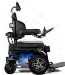
V6 FRONT WHEEL DRIVE - HYBRID BLACK WHEELS