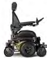
V6 ALL TERRAIN - OFF-ROAD WHEELS