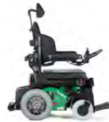
V6 REAR WHEEL DRIVE - HYBRID GREY WHEELS