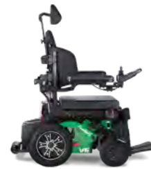
V6 REAR WHEEL DRIVE - HYBRID BLACK WHEELS